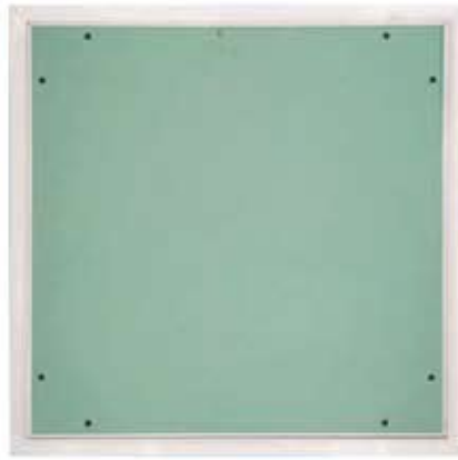
Below View Before Paint